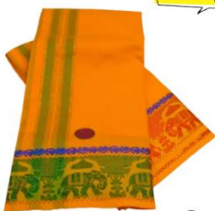
Cotton Cool Men Dhoti Price ₹1250