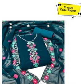
Organza Kurta & Churidar Material Self Design Price ₹1000