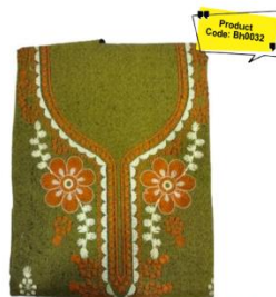
Kashmiri Woollen Salwar Suit Material Price ₹550