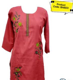
Lifestyle Kurti Price ₹550