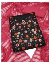
Embroidered 3-Piece Unstitched Dress Material Price ₹4100