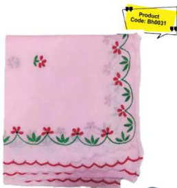
Hand Stitched Cotton Dupatta For Women Price ₹650