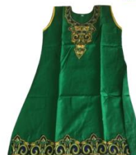
Generic Women Kurti Price ₹1050