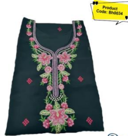
Neck Embroidered Kurti Black Price ₹350