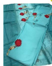
Cotton Salwar Suit Material Embroidered Price ₹1150