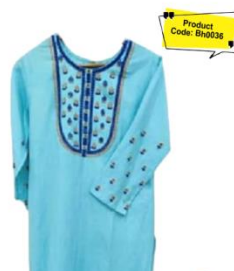
Rayon Cotton Fabric Round Neck With Sleeve And Front Style Kurti For Women & Girls Price ₹950