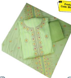
Light Pure Cotton Salwar Suit Material Printed Price ₹600