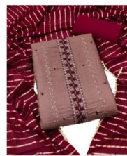
Cotton Blend Salwar Suit Material Embroidered Price ₹850